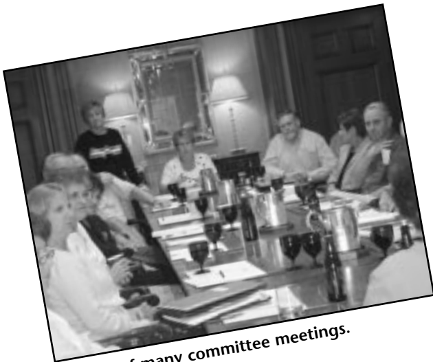
One of many committee meetings.