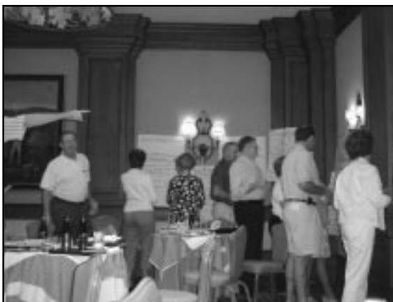
Council members listed goals and priorities of each committee during this activity.