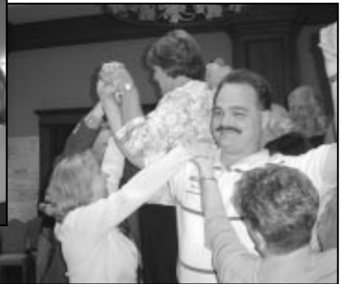
The Council participated in various team building activities during the planning